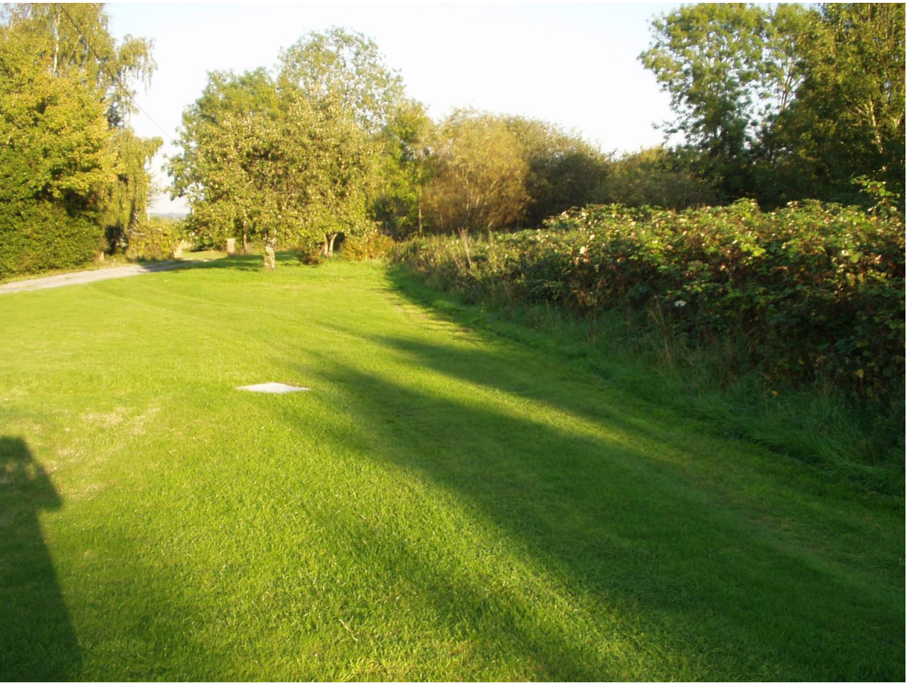
View from within the site looking east