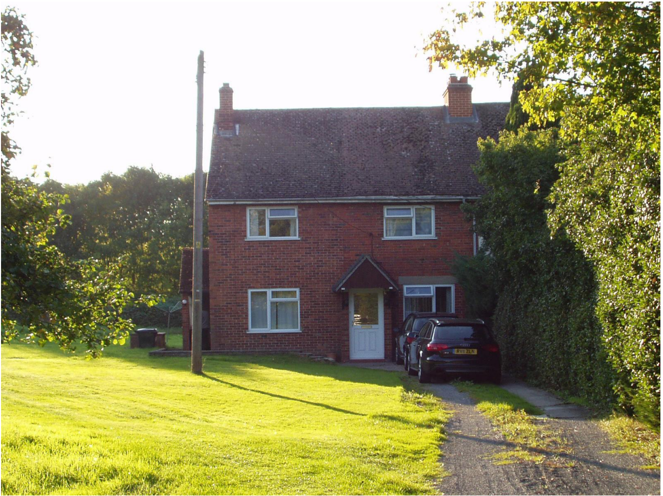
1 The Osiers front elevation