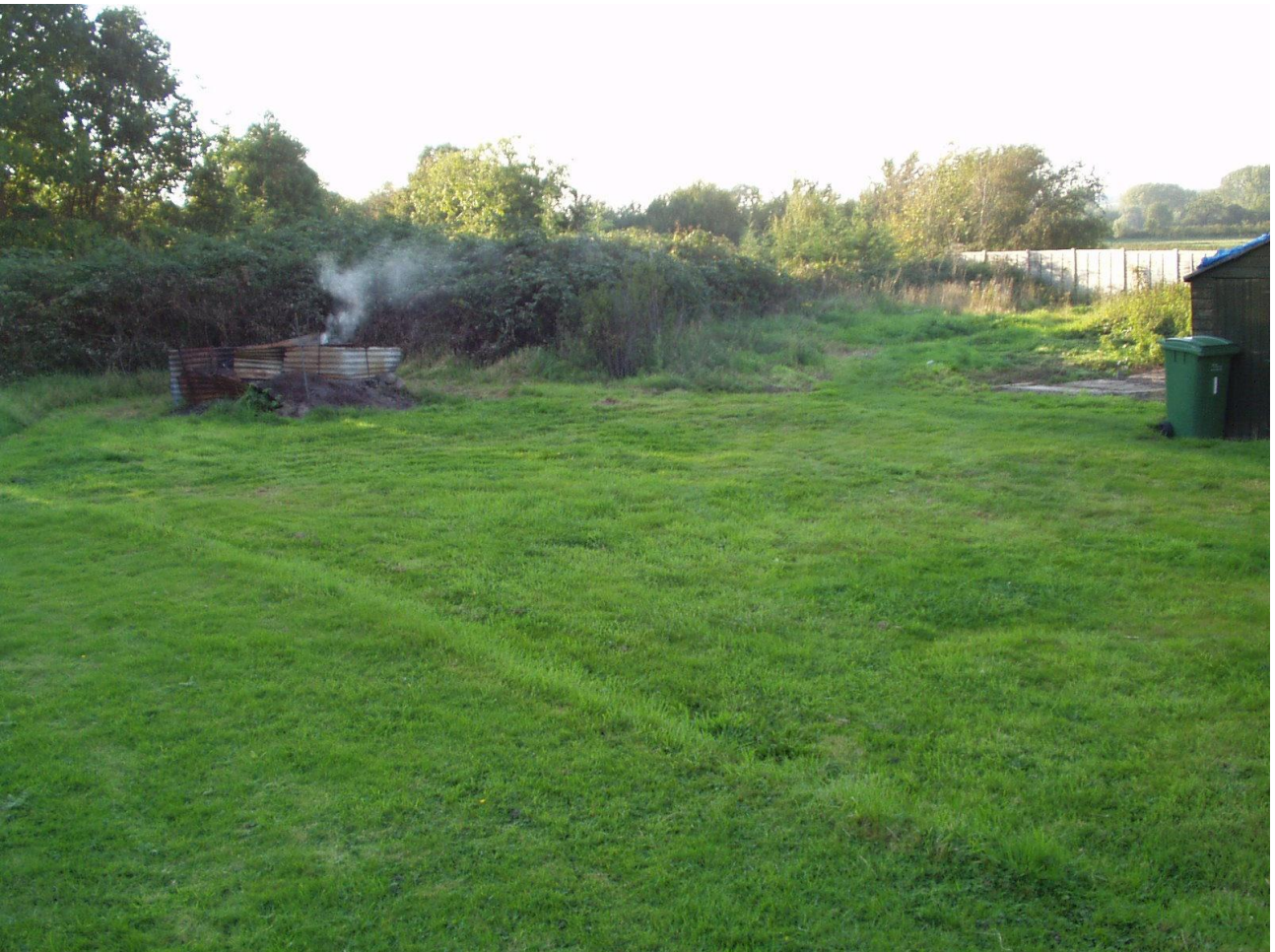
View from within the site looking north