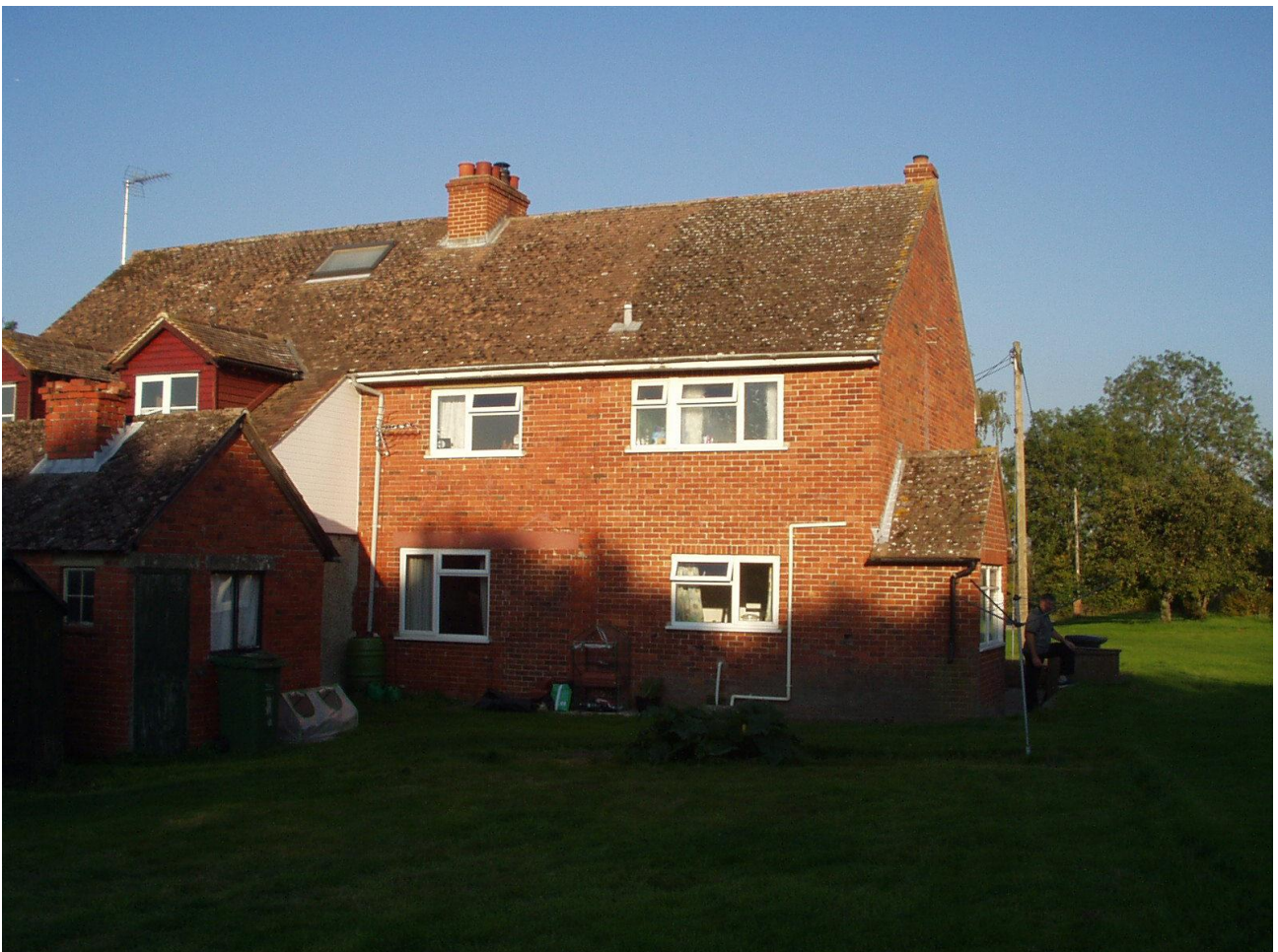
1 The Osiers rear elevation